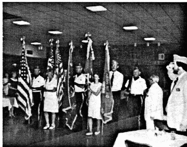
Joint Installation, Post 60